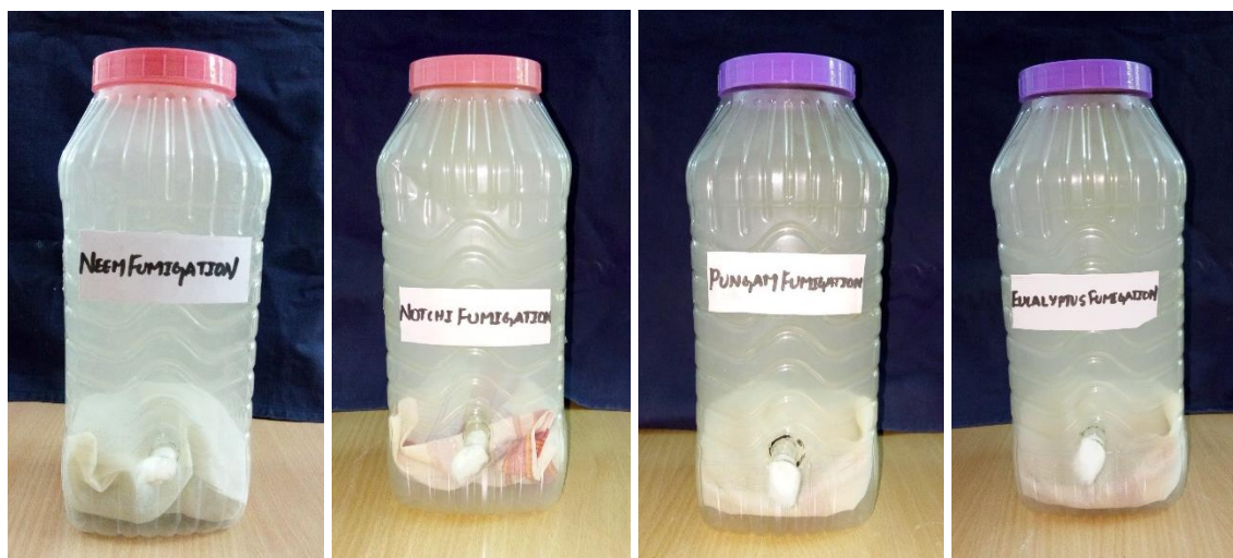
Plate 1: Experimental set up for the application of phyto-fumigants

The experiment was conducted with five treatments and four replications and the data was analyzed statistically by subjecting to analysis of variance using Completely Randomized Design (CRD).