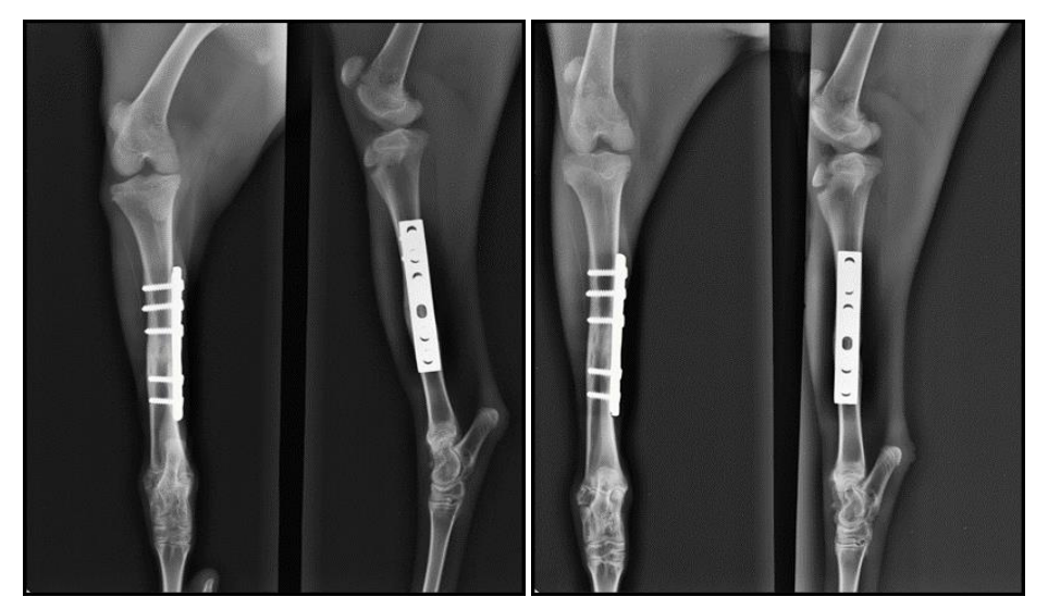
60<sup>th</sup> post-operative day 90<sup>th</sup> post-operative day Plate (b): Radiograph at different time intervals in group II (DCP +Stem cells)