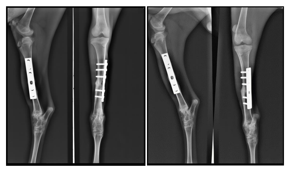
30<sup>th</sup> post-operative day

Plate 1 (a): Radiograph at different time intervals in group II (DCP +Stem cells)