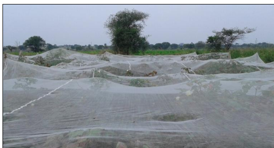
Plate 1: Maintenance of susceptible strains of cotton jassid under protected net in field