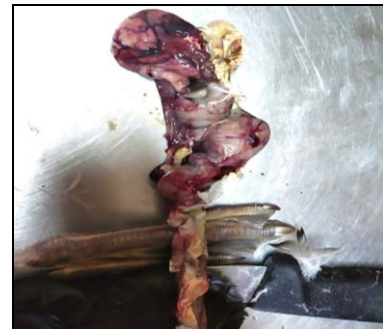
Fig 3: Adhesions in the intestines due to precipitated yolk mass