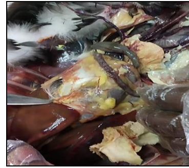
Fig 1: Presence of amorphous yolk material in the peritoneal cavity

After producing the ova (yolks), they are passed to the infundibulum (oviduct) which, in normal egg production, will catch the yolks and transport them through the rest of the reproductive tract until they are eventually expelled as fully-formed eggs. However, when a bird is suffering from egg peritonitis, the yolk is not caught by the infundibulum, but is instead released into the coelomic cavity, where it provides the perfect growth medium for bacteria, with E. coli being most commonly isolated from affected birds. Once the infection has become established, it will infiltrate throughout the coelom and cause a widespread peritonitis. Swollen abdomen is usually noticed in hens with egg peritonitis which is due to the infection within the coelom causing fibrin deposition and fluid accumulation. It is believed that pathogenic E. coli from the normal intestinal microflora are the source of infection for the oviduct and ultimately, the peritoneal cavity when the intestinal barriers are damaged [4].