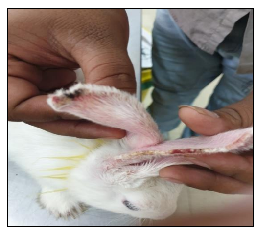
Fig 1: Picture showing severe dry crusty