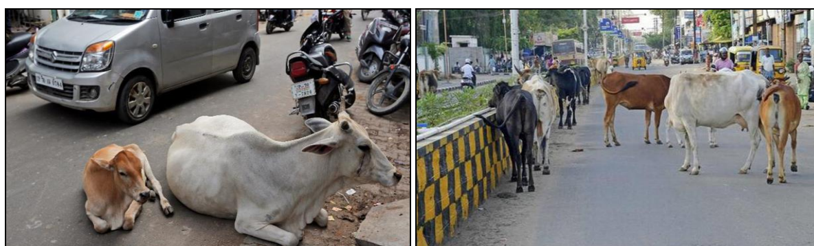
Fig 1: Homeless cattles were abandoned in the city of India

The unproductive cow offers economy benefits to human. The guidelines of centre will provide asylum to unproductive cow. This asylum would be implemented into district of the state. This establishment will transform agriculture system, block, district and standard of living and brings fate in government. The international institution protect unproductive cow with penal code and livestock electronic inspection system. This initiative will prohibit the population of homeless cow. The Conservation and Utilization of Strays cattle promotes rural, urban and education development, forbids violence & miscreant and forms harmony & peace in the society.