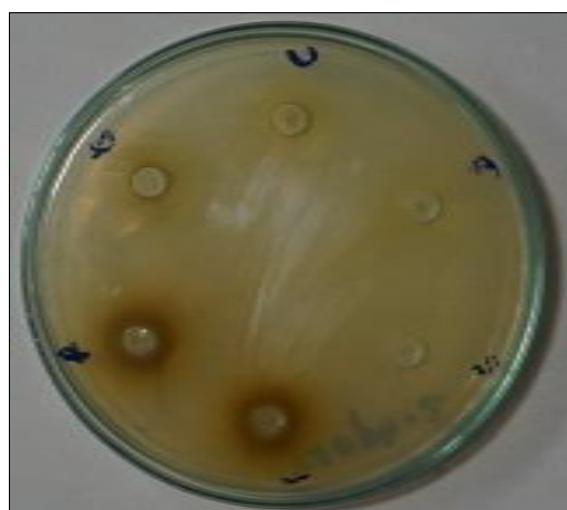
Fig 3: Zone of inhibition of ethanolic extract of Piper nigrum for Streptococcus dysgalactiae

In the present study, ethanolic extract of Piper nigrum showed antibacterial properties against all tested bacteria. Dorman and Deans [28] reported that Piper nigrum inhibited S. aureus as 14.5 mm. Nazia and Perween [29] published that P. nigrum inhibited S. aureus as 23 mm inhibition zone. Zone of inhibition for ethanolic extract of Piper nigrum for Staphylococcus aureus was 13 \pm 0.21 mm and for E. coli as 12 \pm 0.12 mm [30]. Similarly, Joe et al. [31] found ethanolic extract have antibacterial activity for E. coli and Staphylococcus aureus with the zone of inhibition ranging between 12.5 to 16 mm and 11.5 to 15.5 mm, respectively. Pundir and Jain [32] observed that ethanolic extract of black pepper showed antibacterial activity against all test bacteria with zone of inhibition ranged between 15 mm and 22 mm. According to Zarai et al. [33] inhibition zone of Piper nigrum shown 8-12 mm for S. aureus and 7-14 mm for S. epidermidis . All of extracts of Piper nigrum were inhibited S.