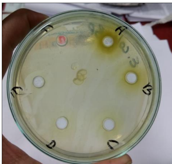
Fig 2: Zone of inhibition of ethanolic extract of Citrullus colocynthis against E. coli

The zone of inhibition (mm) against any Streptococcus spp. and E. coli was not observed at the concentration of 15.625 mg/ml and 7.812 mg/ml of ethanolic extract of Citrullus colocynthis .