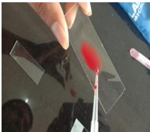
Fig 4: Crossmatching of donor RBC and recipient Serum indicating no agglutination