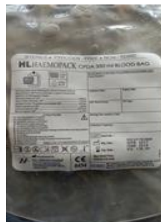
Fig 3: Blood Transfusion Bag –CPDA