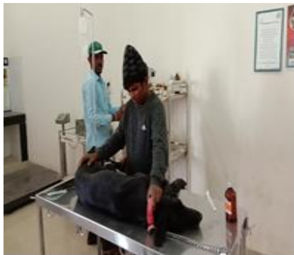
Fig 5: Blood transfusion and Mild Fluid Therapy