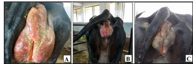
A. Before treatment B. 2 nd Day of post therapy C. 3 rd Day of post therapy

swollen vulva. Then the cow was treated with Enrofloxacin @ 4.5gm / kg body weight daily for 5 days, anti-inflammatory drug Meloxicam @ 0.5mg/kg body weight daily for 5 days and Chlorpheniramine Maleate @ 10ml injected through intramuscular route with Serratopeptidase bolus@ two bolus orally daily for 5 days and Reproductive Care Aerosol Spray Can (Pop-in spray) (Natural remedies) was applied externally over the vulva. Swelling of vulva was reduced after third day of post therapy (Fig. 3 A, B & C). The haematological parameters revealed improvement of neutrophil count after third day of post therapy (Table 1).