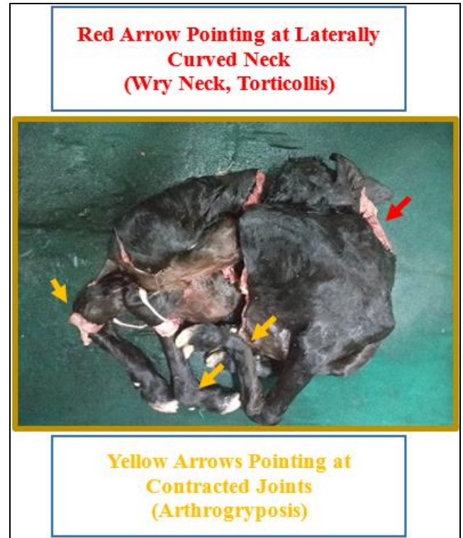
Fig 2: Arrows indicating torticollis and arthrogryposis condition of crooked calf.