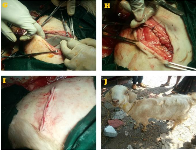
Fig 2G: Uterus was closed in Cushing followed by Lembert suture pattern using vicryl size 2-0. H: Muscle layers was closed in simple continuous pattern using vicryl size 1-0. I: Apposed the skin incision in horizontal mattress pattern with monofilament nylon. J: Animal on the fifth postoperative day.