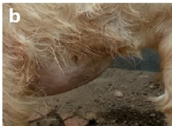
Fig 1b: Ventral distention of abdomen