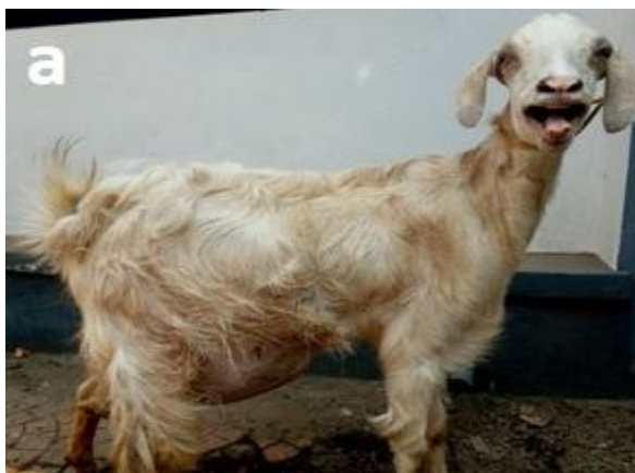
Fig 1a: Full term pregnant goat

dystocia due to uterine adhesion. It was decided to perform an emergency cesarean section to correct the condition.