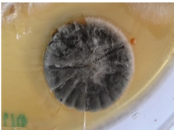
Fig 3: Colony character of Curvularia spp. in Sabourauds Dextrose agar