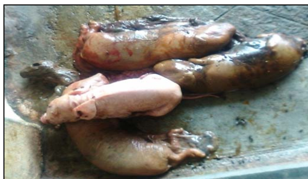
Fig 2: Mummified fetuses along with stillborn fetuses and live born weak piglets

Clinical signs in sows and gilts recorded were mostly anestrus, abortion, stillborn and mummified fetuses, small litter size and weak born piglets. In the present study we recorded mummified fetuses along with stillborn fetuses and live born weak piglets (Fig. 2). A total of 86 fetuses and weak piglets were necropsied. Pathological changes recorded grossly were congestion in the body surfaces, internal organs with accumulation of serosanguinous fluid in the body cavities of some necropsied late term aborted fetuses. In few cases fetuses undergo maceration and mummification. The microscopic changes recorded were pneumonic lung, depletion of lymphocyte in the lymphoid organs of piglets, myocardial degeneration or necrosis with oedema were found in some late term aborted fetuses.