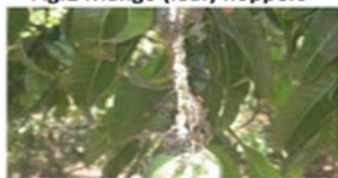
Fig:3 Mealybugs On fruit