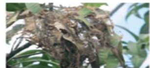
Fig:5 Webbing of terminal leaves due to leaf webber