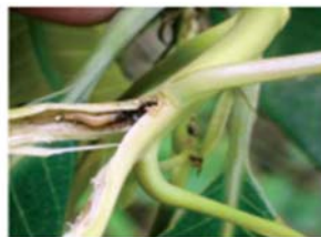
Fig: 9 Larva of shoot borer

Young trees may succumb to the attack. Caterpillars bore into the trunk or junction of branches Caterpillars remain hidden in the tunnel during day time and come out at night, feed on the bark. Presence of gallery made out of silk. Larva - Stout and dirty brown in colour. Adult-Stout yellowish –brown moth with brown wavy markings on the forewings Hind wings is white colour. Males are smaller than the females. Figure 20 showing Bark borer on stem.