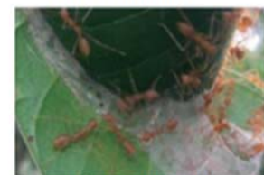
Fig: 12 Red ant