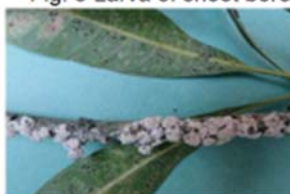
Fig:11 Scale insect