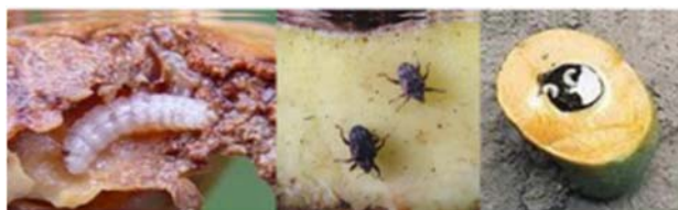
Fig: 17 Mango nut weevil