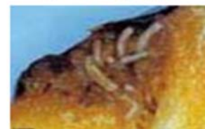
Fig:16 Maggots of fruit fly on mango fruit