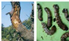
Fig:8 Stem borer infested trunk