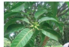
Fig:14 Shoot gall psylla