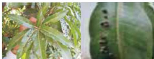
Fig:18 Leaf gall Midge