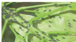
Fig:1 Mango (leaf) hoppers