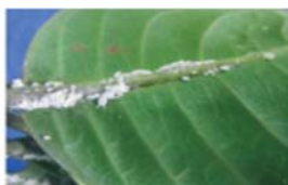
Fig:2 Mealybugs on leaf