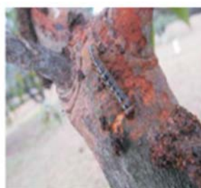
Fig:20 Bark borer