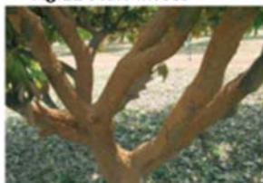
Fig: 13 Termites