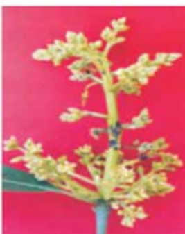
Fig:19 Inflorescence midge