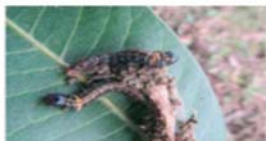
Fig:6 Larvae of leaf webber