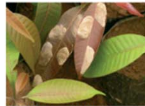
Fig:10 Leaf miner