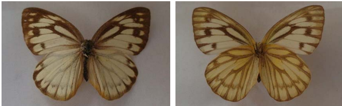
Fig 4: Dorsal (left side) and ventral (right side) views of WSF Cepora nerissa adult

formed second peak in October. The second peak of WSF was higher than first peak of WSF which occurred in May. The peak of the DSF which occurred in January was far lower compared to the first and second peak of WSF adults. The transition period of WSF to DSF was October and the transitions of DSF to WSF were found to occur in March (Figer-3).