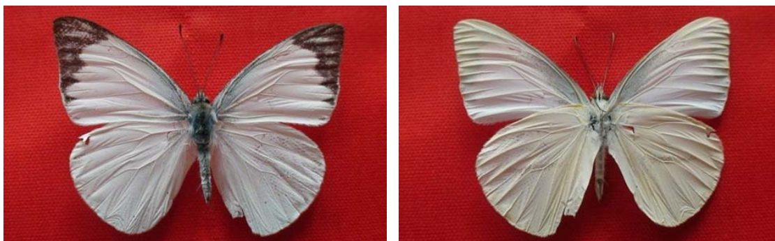
Fig 2: Dorsal (left side) and ventral (right side) views of DSF Appias libythea adult

ventral side of the forewing and the entire hind wing was little cream with gray scaling. Slightly yellow narrow basal streak, lies along the costa on each hindwing. Ventral side of the hind wing there was a white discal band and a more diffuse row of postdiscal spots (Figure-1).