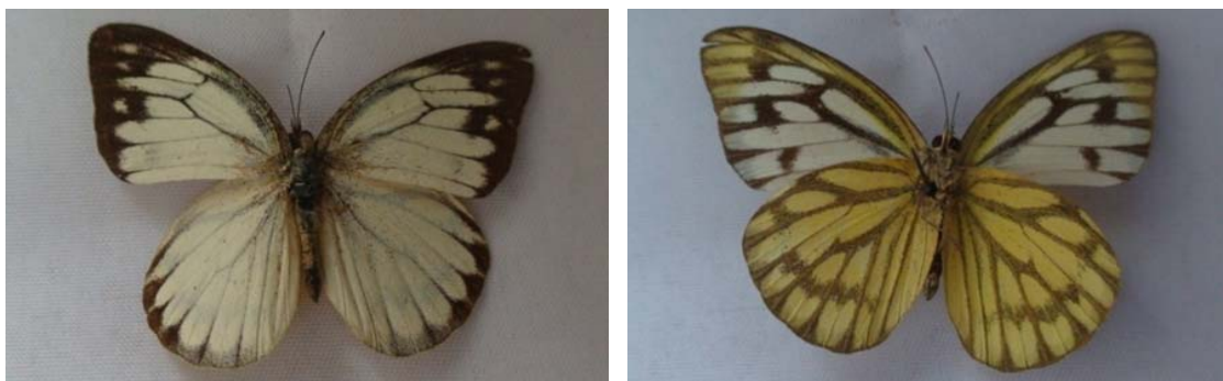
Fig 5: Dorsal (left side) and ventral (Right side) views of DSF Cepora nerissa adult

series of dusky spots in interspaces 1 to 6; more often than not the spot in 5 entirely absent. Ventral side of both wings as in the dry-season specimens, but basal black area became darker and border than DSF. Subterminal series of dusky spots in interspaces 1 to 6 became more prominent than DSF (Figure-4).