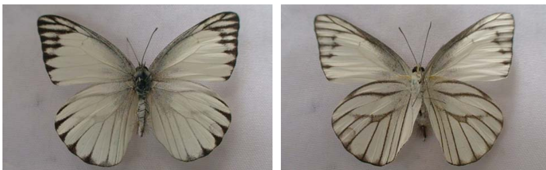
Fig 1: Dorsal (left side) and ventral (right side) views of WSF Appias libythea adult

We have identified two butterfly species ( Appias libythea and Cepora nerissa ) from Pieridae family as good candidates for seasonal morphs viz. dry season form (DSF) and wet season form (WSF) according to the season when they appeared as adults.