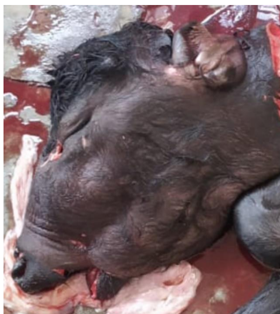
Fig 2: Note oversized fetal head with partial agnathia and bilateral anophthalmia.