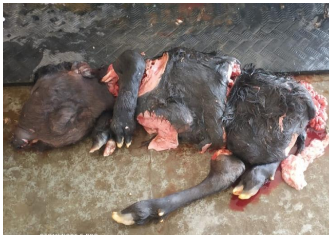
Fig 3: Fetal extraction after fetotomy.