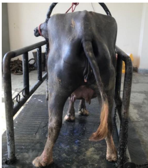
Fig 4: After treatment of hydroallantois.